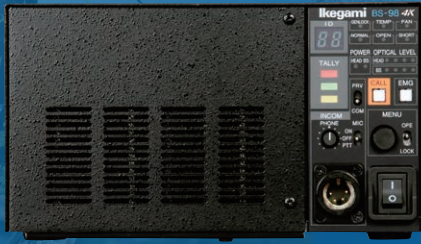
Base Station BS-98