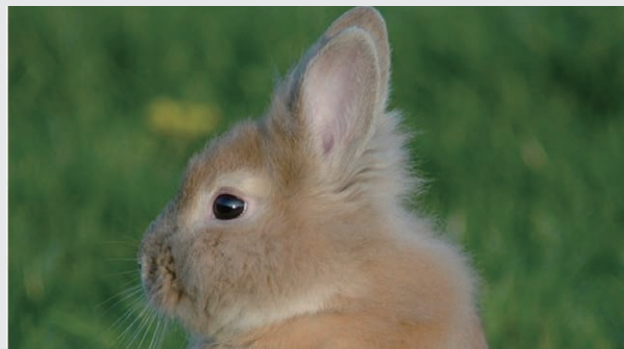
Super Resolution Technology

The BS-98/CCU-980 have a built-in 4K SR CONV video processor to provide a high quality 4K (3840×2160) live output. It is not just upscaling from HD signal. It includes so called Super Resolution with image enhancement in the Ultra HD band, a new technology to reconstruct high resolution signals that is not possible in conventional HD processing!