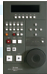
SRC-11 Remote Controller